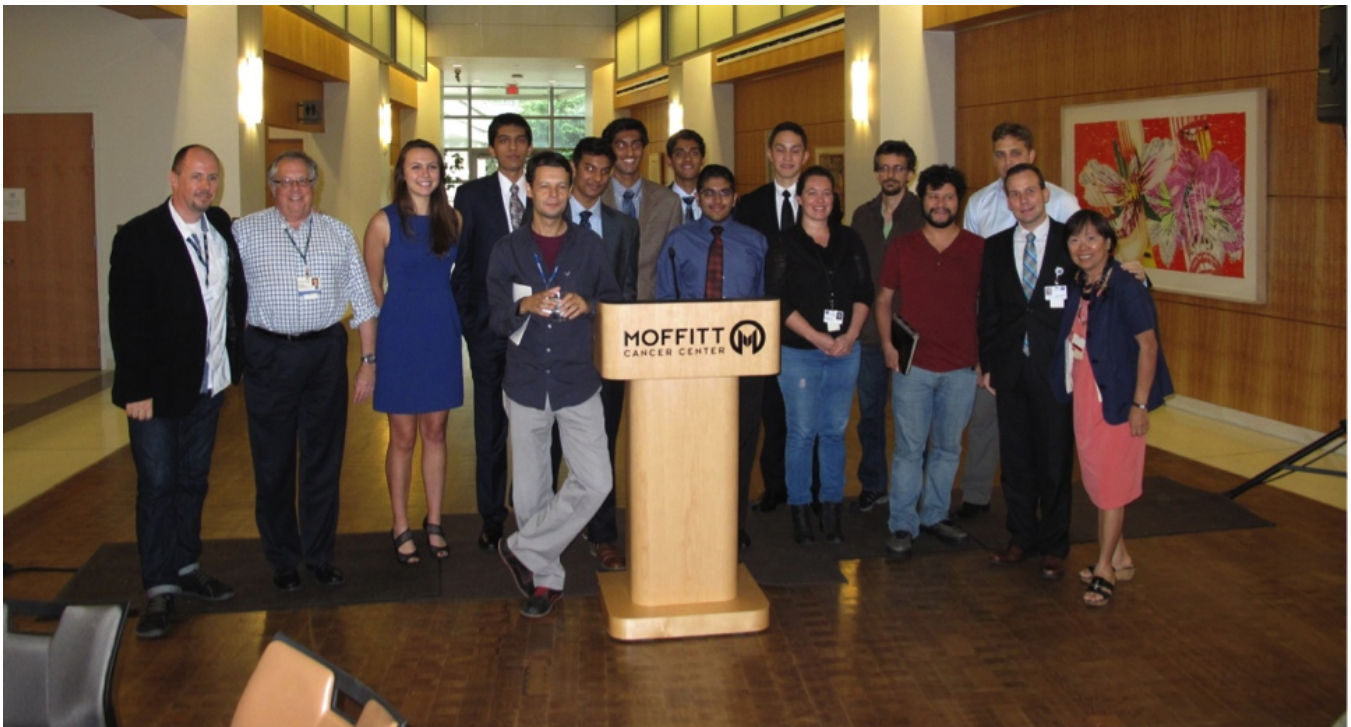
Group Photo with Students and Mentors